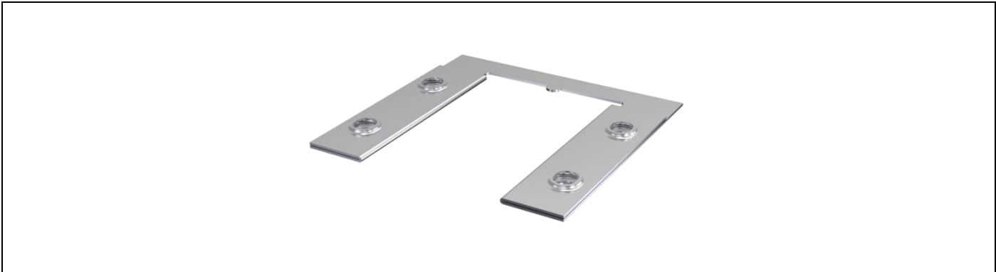
Grounding Clip for BT Rail Part No.: R2-GC (bar code: 12-023-00101)